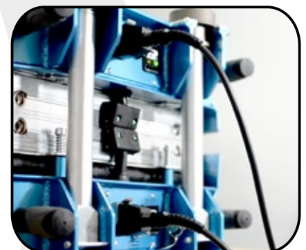
E-Komp 800x500 230V 16A with separate power connections.