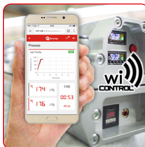
Possibility to integrate Wi-Control (optional).