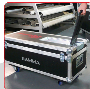
Flight case included.