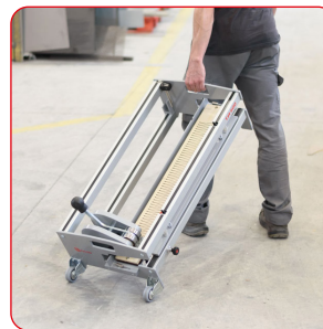
Built-in wheels for easy transport.