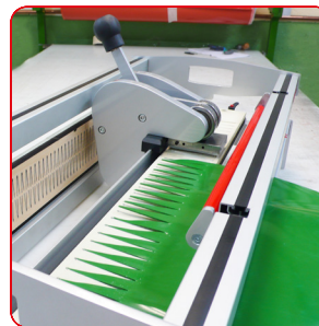
Excellent hold even on the thinnest belts.