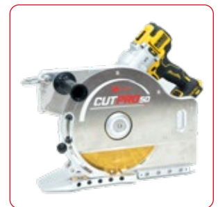
Belts up to 51 mm (2') thick.