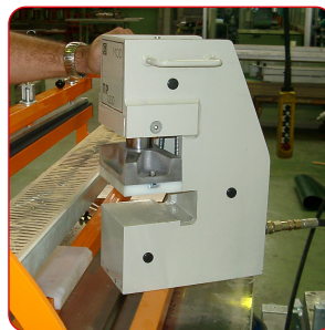
Removable head for easy transport.