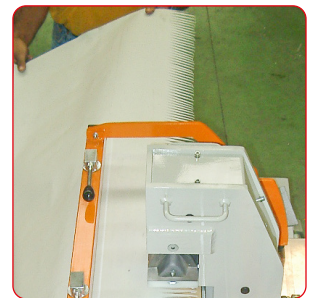
Open ends for wider belts.