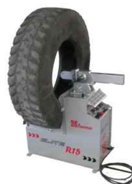
Eli e R15