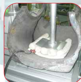
Pressure system with squeezing sacks and plates.