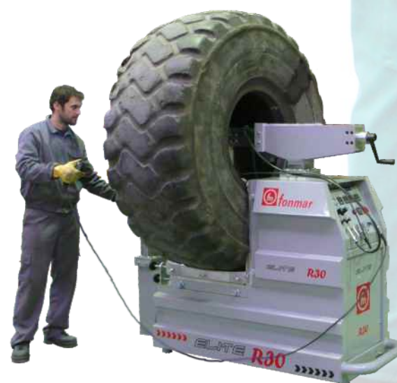
Eli e R30